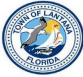
Exhibit D – Budget-In-Brief