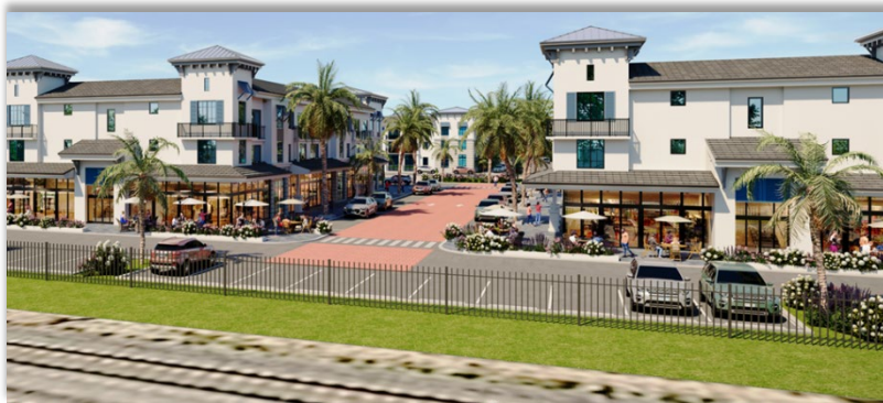
Rendering of Lantana ParkSquare as seen from the FEC Railway

In April 2023, Integra Solutions, LLC (Integra) purchased the 18-acre site located at the corner of Hypoluxo Rd and Dixie Hwy, commonly referred to as the vacant Kmart site. Since that time, staff has been collaborating and coordinating with Integra's development team to deliver a well-planned mixed-use development and vibrant space that will enhance the site's visual appeal and address the community's diverse needs. On 02/12/2024 a public workshop was held whereby Integra presented the site's conceptual site plan and renderings (as currently drafted). During the workshop, the Town Council provided positive feedback on the project's conceptual plan, commending its thoughtful design and alignment with the community's vision and Master Plan. Overall, the Council's endorsement (through consensus), signifies confidence in the project's potential to breathe new life into the community's fabric. In addition, the public was given the opportunity to ask questions and provide comments. As a result, staff has moved forward with next steps including both text and Comprehensive Plan amendments. Most recently, staff has provided the developer with comments after reviewing the Special Exception, Site Plan and Landscape Plan. For more information regarding the materials that were presented at the 02/13/2024 workshop (e.g., Site Plan, Renderings and PowerPoints), please contact Town Administration at (561) 540-5004.